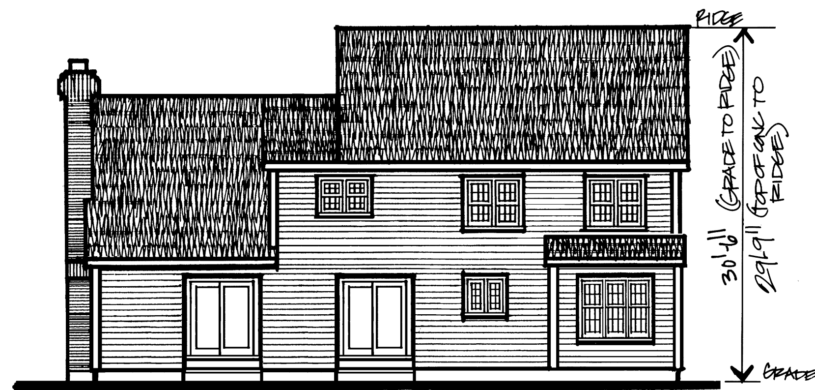
REAR ELEVATION \frac{1}{8}'' = 1'-0''