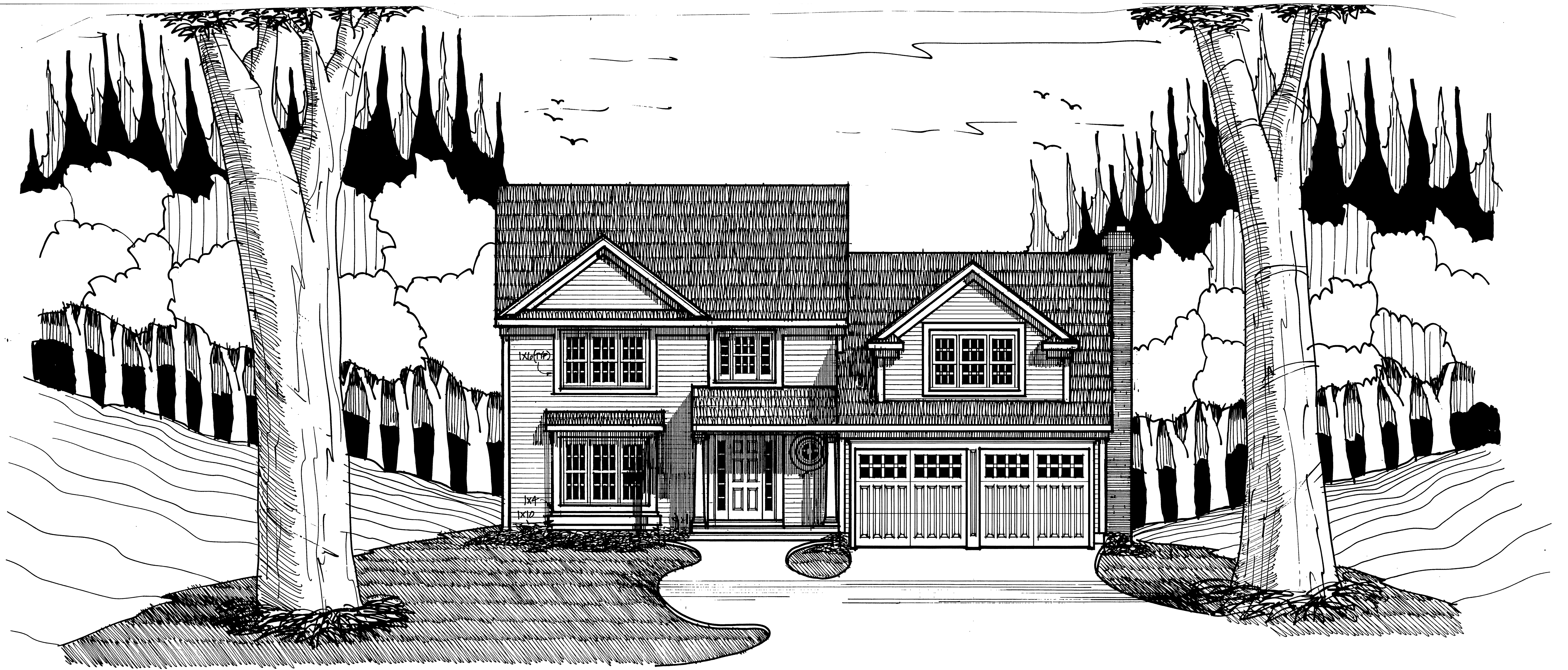
FRONT ELEVATION \frac{1}{4}'' = 1'-0''