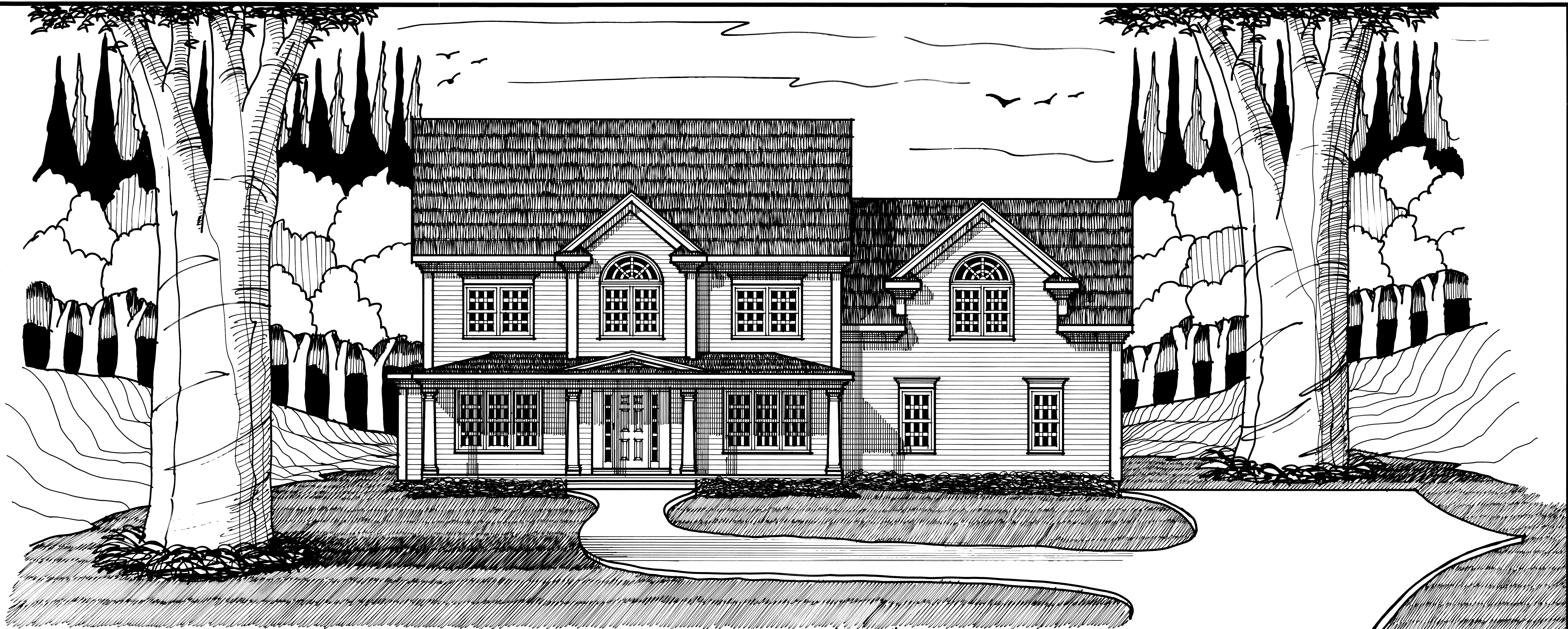
FRONT ELEVATION \frac{1}{4}'' = 1'-0'' SHOWN W/OPTIONAL EXTRA TRIM, WINDOW HEADERS, AND FRONT PORCH