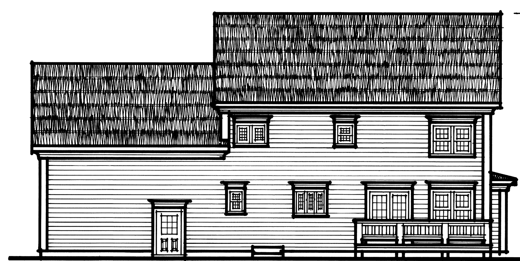
REAR ELEVATION \frac{1}{8}'' = 1'-0''